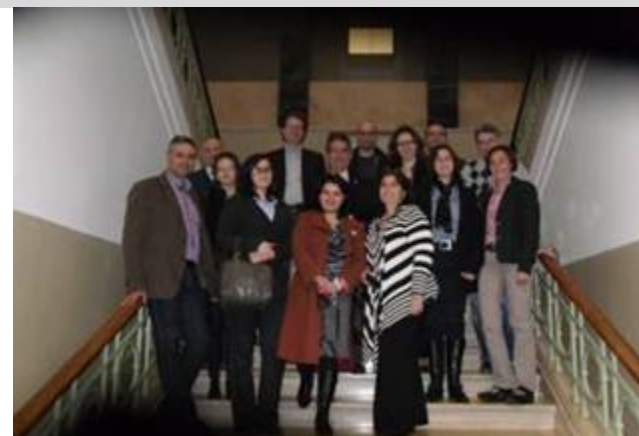
Figure 2. eReNet Team - 1 st Progress Meeting, Sertā, Portugal

Additional issues regarding eReNet's progress were also addressed during the meeting.